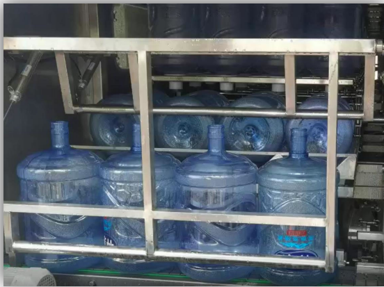
Figure 2:BY-PL Series—750 to 2000 BPH

We design, manufacture, install, and service bottling equipment all over the globe. Our support team will help provide spare parts, audits, and troubleshooting for the life of your machine.