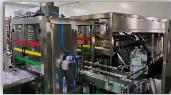
Figure 1:BY-XGF series_ 300~600BPH

Whether you're producing water, our unmatched expertise helps you achieve more with extensive technical knowledge and packaging capabilities.